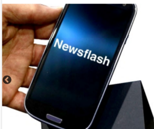
News Flash: Get news alerts from the Times-Tribune on your mobile phone or in your email.