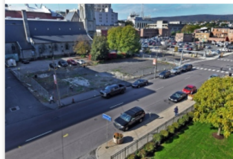
The city plans to convert a vacant lot at Wyoming Avenue and Linden Street into a pocket park. Some members of city council would rather see it developed.